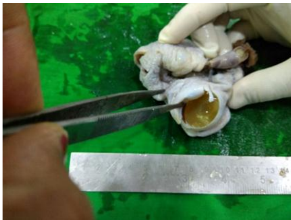
Figure 3: gross specimen of serous cystadenoma