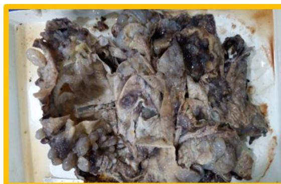
Figure 1: gross specimen of Boderline mucinous cyst adenoma

Laterality: 92 % cases are unilateral. Right side were found more common. only two cases found bilateral.